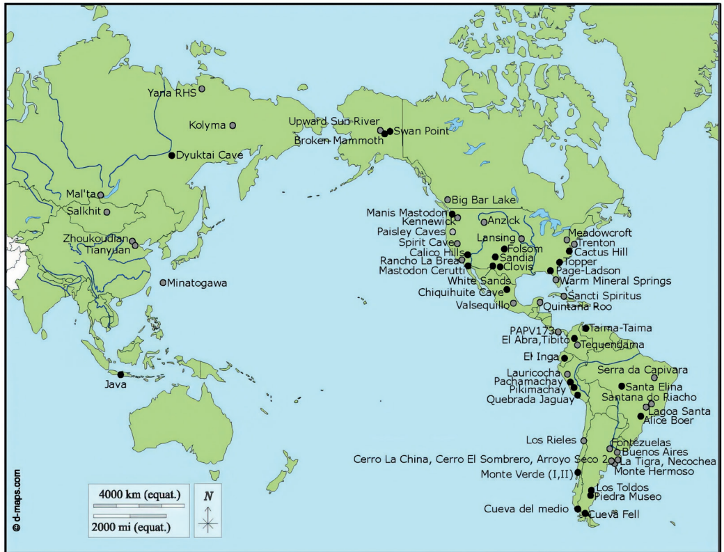
Fig. 2 - Map showing the geographical location of the archaeological sites and archaeological localities from Asia, North America, Central America, and South America mentioned throughout the text. The archaeological sites from Europe are not depicted in this figure. The dark grey circles indicate archaeological sites in which human remains were recovered, the light grey circle indicates a site where human coprolites were recovered (Paisley Caves).

the re-dating of presumed ancient butchering sites confirmed the coexistence of humans and megafauna (Hubbe et al. 2013; Deviese et al. 2018). Today, the debate continues, focusing on whether the arrival of humans in the Americas occurred before or after the Last Glacial Maximum (LGM) (LGM: 28,000-18,000 years BP).